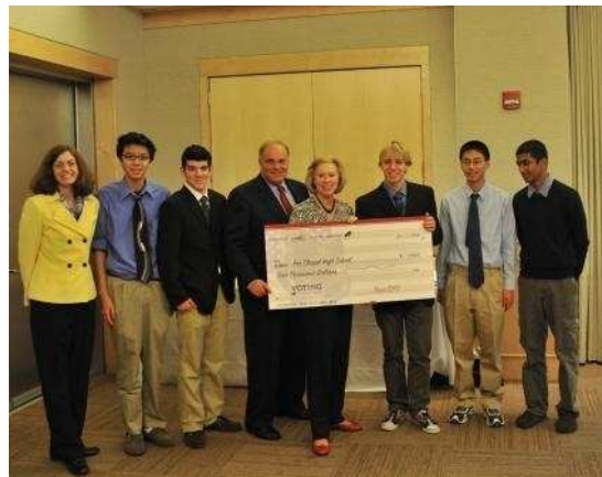
Governor and Judge Rendell present the check to Fox Chapel winners

The winning videos are viewable at www.pennCORD.org/news/student-videos-on-demand/ . All top twenty videos are available at Comcast On Demand through January 12. You can find the videos in the PennCORD folder located under the Get Local section.